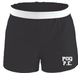
Soffe The Authentic Soffe Short-JUNIOR CUT