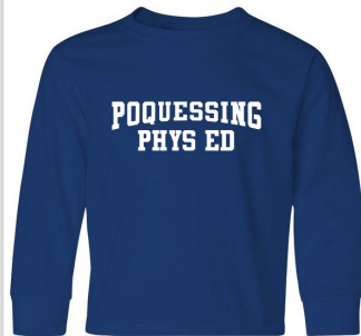
Jerzees Youth Dri-Power Active Long Sleeve 50/50 T-Shirt