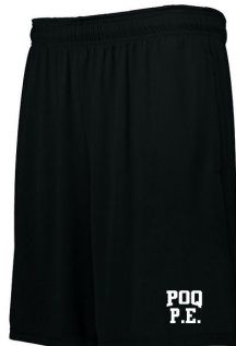
Holloway Whisk 2.0 Shorts