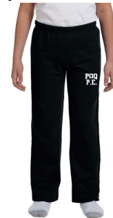
Gildan Heavy Blend Youth 8 oz., 50/50 Open-Bottom Sweatpants