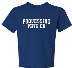
Jerzees Youth Dri-Power Active 50/50 T-Shirt

Online Store Deadline: Sunday September 22nd, 2019 (11:59pm EDT)