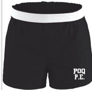
Soffe Girls The Authentic Soffe Short