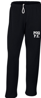
Gildan Heavy Blend Adult Open Bottom Sweatpants