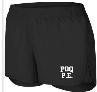
Augusta Girls Wayfarer Short