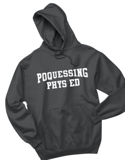
JERZEES - NuBlend Pullover Hooded Sweatshirt