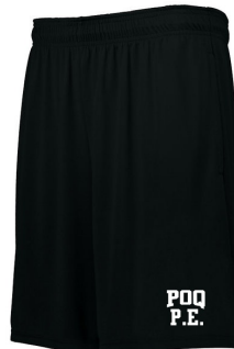
Holloway Youth Whisk 2.0 Shorts