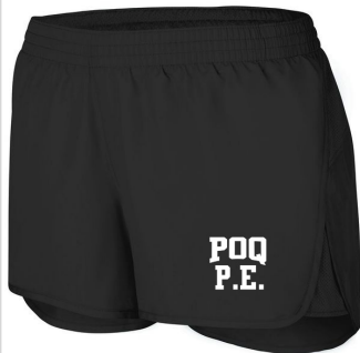
Augusta Ladies Wayfarer Short