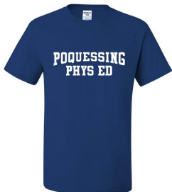
Jerzees Adult Dri-Power Active 50/50 T-Shirt