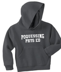
JERZEES - Youth NuBlend Pullover Hooded Sweatshirt